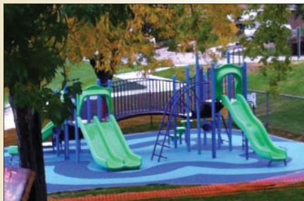
The new playgrounds will have rubberized surfaces in the fall zones.

The playground now sports two separate playground areas: one for children ages 2 to 5, the other for children 5 to 12. The equipment has been upgraded with colorful modern equipment, a rubberized fall zone surface, and an ADA-accessible walkway.