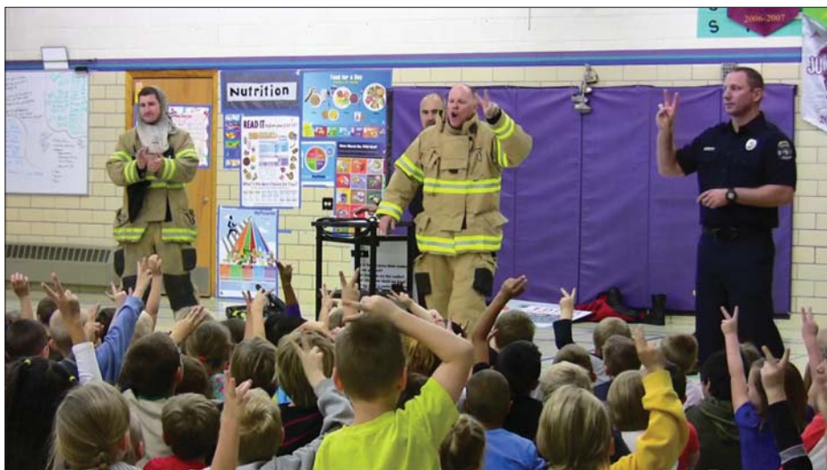
During Fire Prevention Week in October, Englewood Firefighters visited Englewood's elementary schools to educate students about the importance of fire prevention. This year's theme was "Preventing Kitchen Fires." By the end of the week, the firefighters had shared fire prevention and safety tips with over 1,700 students from grades K-6.