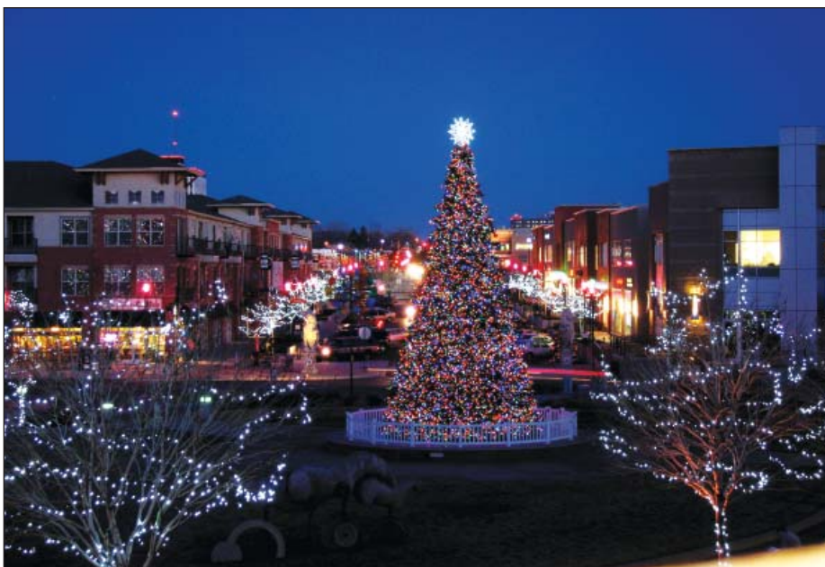
The Mayor will light the Christmas Tree in front of the Englewood Civic Center (and all the lights along Englewood Parkway) at 5:30 pm on Monday, December 2. The community is invited to join the festivities.

Enjoy breakfast with Santa, featuring all-you-can-eat pancakes. Tickets are $4.50/ages 2-10; $5.50/11 and up; and free for anyone under 2 years of age. Tickets are available at the Malley Center, Englewood Recreation Center, and online at www.engagewoodrec.org .