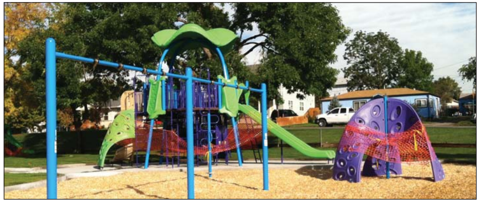
Here's a sneak peek at the new playground equipment at the Northwest Greenbelt. The new playground will feature updated equipment, a rubberized fall zone surface, and an ADA-accessible walkway.

Over the last several months, Englewood's Parks crews have overseen the renovation of the playground, using Open Space Grant funds from Arapahoe County. The old playground was over 20 years old and had begun to show signs of its age.