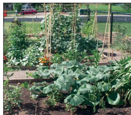
The Englewood Community Garden is located at 601 W. Dartmouth (across from Cushing Park).

If you are looking for a way to add more greenery to your own yard, make sure to take advantage of the Parks Division's Arbor Day Tree Sale on Saturday, April 20 at Cushing Park (see page 6 for details).