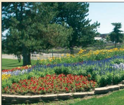
This flower bed, near Broadway and Hampden, is maintained by volunteers through the Parks Division's "Adopt a Flower Garden" program.

The Adopt A Flower Garden program is a great community service project for any age group. For more information on volunteering, contact our Parks Division at 303-762-2523 or 303-762-2542.