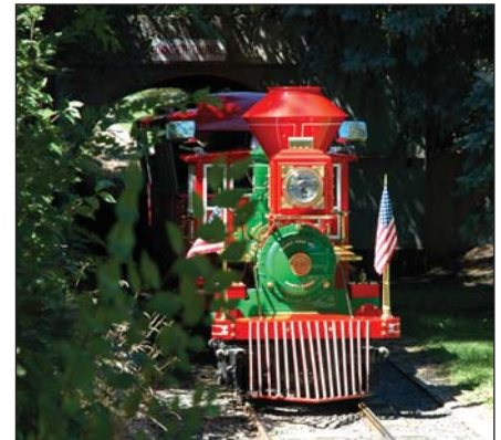
Ride the Miniature Train or visit the Children's Farm at Belleview Park (5001 S. Inca Street).