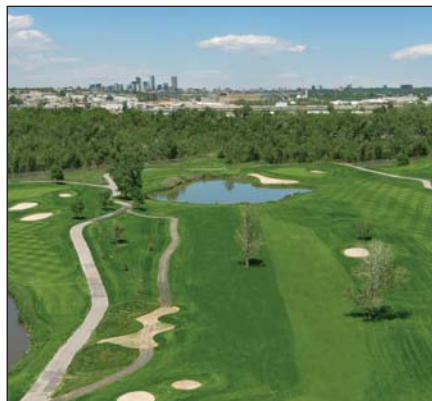
Broken Tee Englewood golf course boasts a Dye Design course and some of the most modest greens fees in the region. Visit www.brokentee.com for details.

For a complete list of upcoming summer events and programs, visit the Calendar of Events on www.engagewoodgov.org . The website also includes details on the locations and amenities at all Englewood parks and information on summer classes and programs offered through Englewood Parks and Recreation.