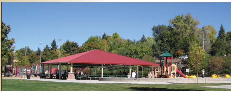
Have a picnic and visit the playground at any of Englewood's parks. Pictured above: Belleview Park.