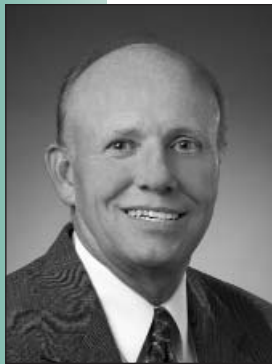
Jim Woodward Mayor At Large