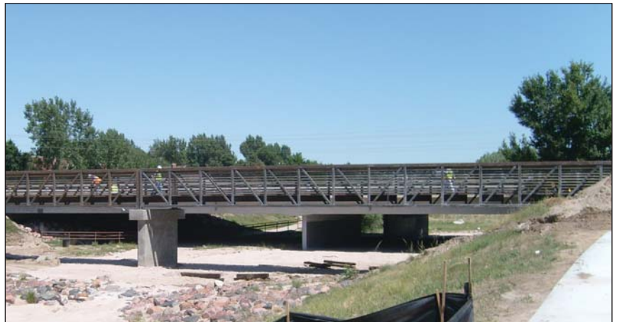
The bicycle/pedestrian bridges planned across the South Platte River at Dartmouth and Oxford Avenues will be similar to the one pictured above.

The Dartmouth Avenue bridge offers a link from the Little Dry Creek trail system and will offer easy access to and from the Mary Carter Greenway trail to the south and the South Platte River