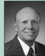
Jim Woodward Mayor At Large