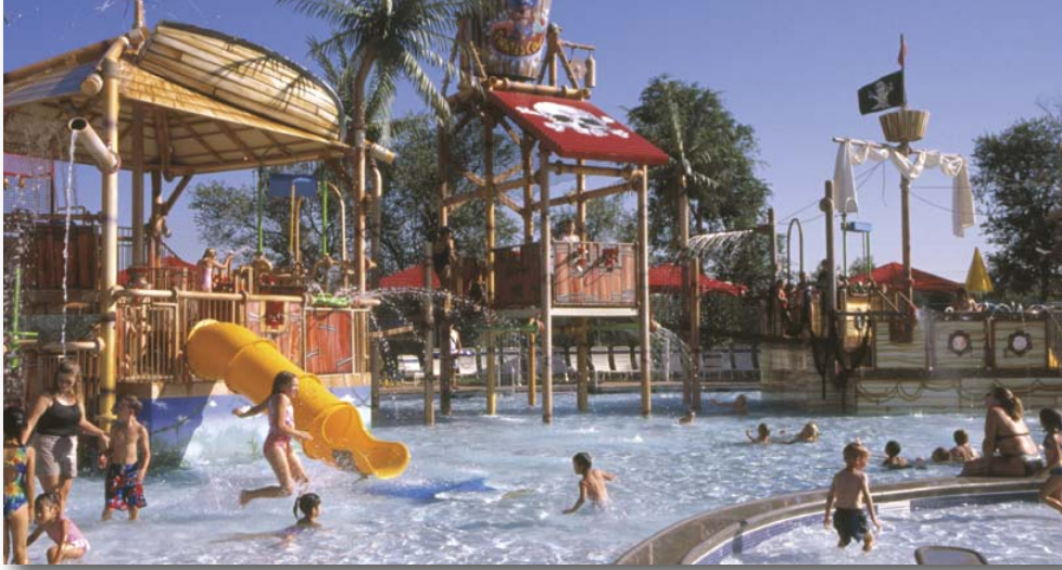
The Leisure Pool at Pirates Cove features a large play structure, including the 750 gallon dump bucket, which is quite popular with those who are brave enough to stand beneath it!