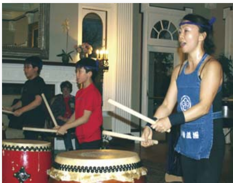
Boulder Taiko's "Habiki" ensemble (left) will kick off the Summer Reading program with a performance at Hampden Hall.

Registration for this year's program starts Tuesday, May 29. Visit the Library's Children's Desk to sign up or for more information on the Summer Reading program.